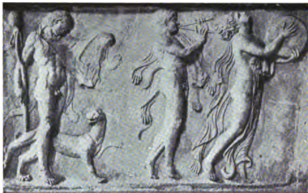
Fig. 48. Bacchic Procession.

At Thebes Pen'theus, the king, forbade the revels, and when the women of his city, in de-